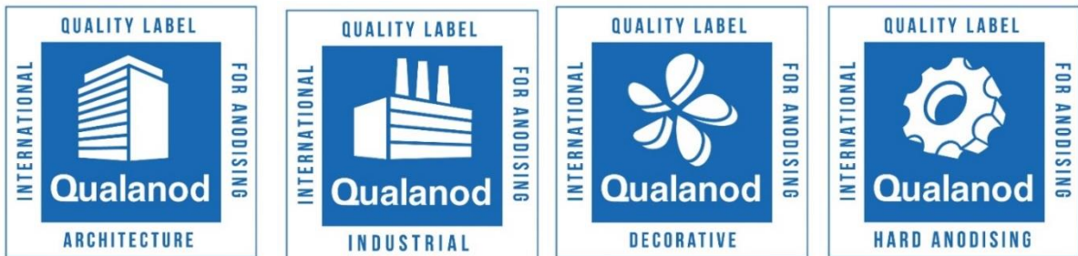
Figure 1. The use of the quality label

The holder shall, at all times, give the general licensee any information required with respect to his use of the quality label.