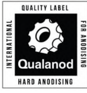
d) Label for hard anodizing

e) Example of a label in black and white