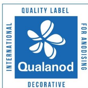
g) Example of the use of a label with additional text as can be required

QUALITY LABEL FOR ANODIZING OF ALUMINIUM